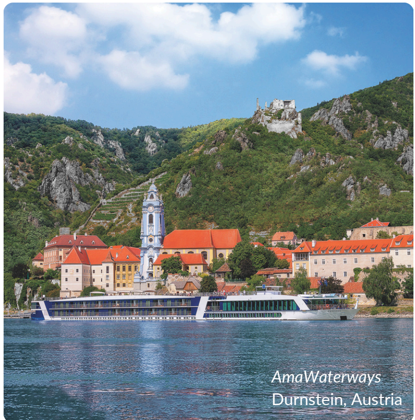
AmaWaterways Durnstein, Austria