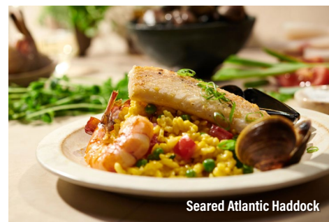
Seared Atlantic Haddock