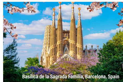
Basílica de la Sagrada Família, Barcelona, Spain

Our exclusive itineraries and shore excursions curated with HISTORY® blend the art of leisurely travel with the power of immersive storytelling.